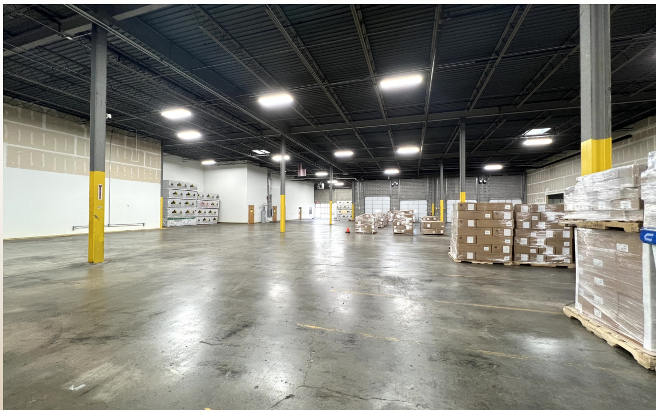
OPEN WAREHOUSE Immediately available