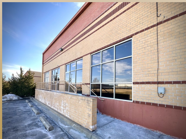
Private Entrance to space