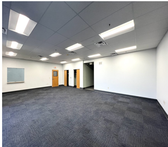
Open Office area as well as private offices

Close to Major Highways, MO. 210, I-35 I-29, I-435