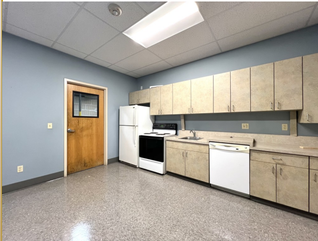
Large Break Room