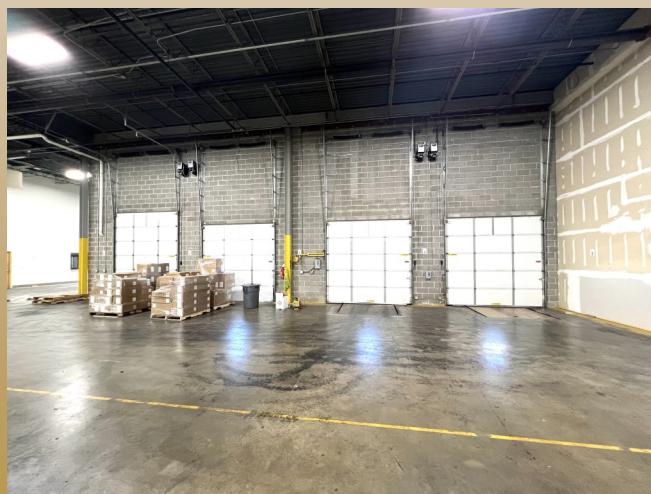
4 Dock Doors