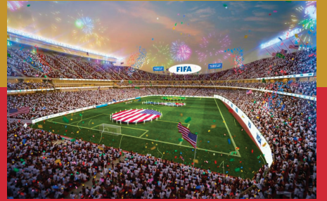
FIFA WORLD CUP 2026 HOST CITY